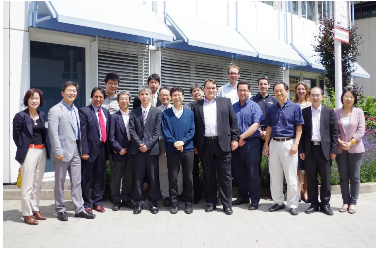
Fig. 2 Participants of the meeting of WG 7 at Fraunhofer IPA in Stuttgart

The latest standardisation meeting took place in Stuttgart (Germany) from 9<sup>th</sup> to 17<sup>th</sup> June. Working groups 1, 3, 7 (Fig. 2), 8 and 10 met together with the superordinate committee SC 2.