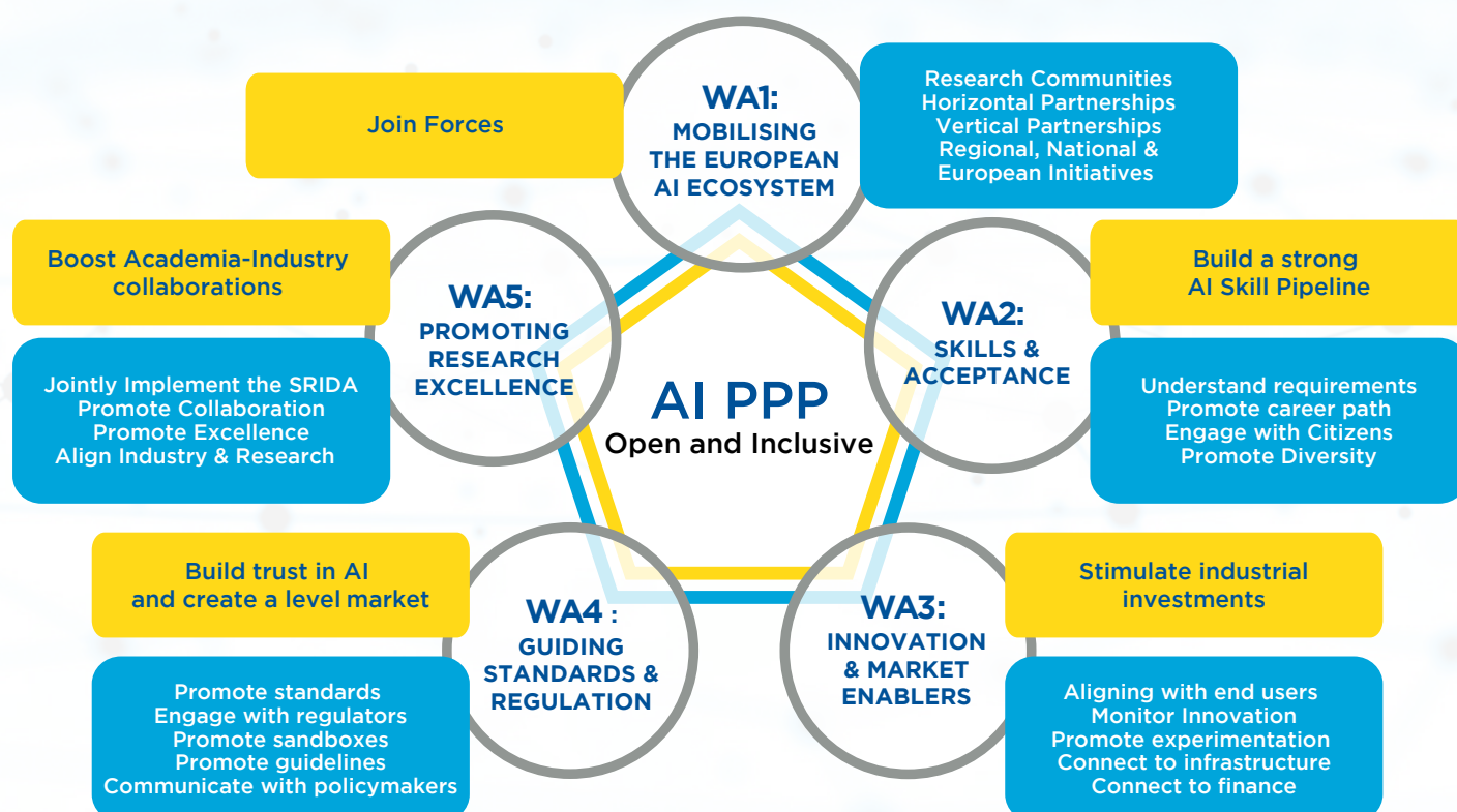
Figure 3: Summary of Work Areas

The implementation of the AI PPP will target both the Digital Europe Programme to build up AI capacity & infrastructure and Horizon Europe for research & innovation. To this end, the AI PPP will be based on five strategic Working Areas (WA).