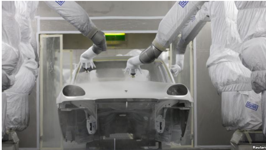
Robot arms coat a Porsche Macan at the new plant in the eastern German city of Leipzig, Feb. 5, 2014.